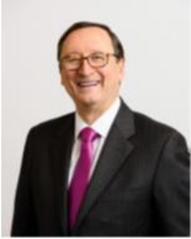
Executive Director; CEO

Director qualification highlights include: