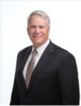
Independent Director; Audit & Risk Committee Member