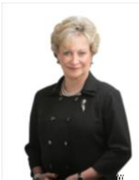
Independent Director; Compensation Committee Member