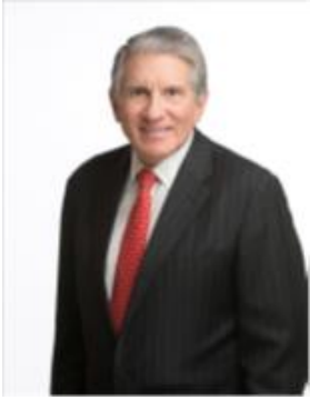
Independent Director; Audit & Risk Committee Chairman