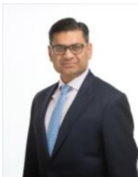
Independent Director; Compensation Committee Member