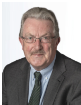
Independent Director; Audit and Risk Committee Chair; Corporate Governance and Nominating Committee Member