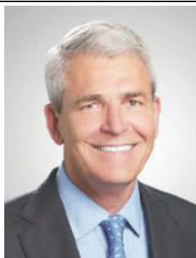
Independent Director Nominee (service to commence October 1, 2022)

Director qualification highlights include: