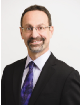
Chief Executive Officer