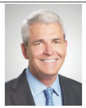
Independent Director Nominee (service to commence October 1, 2022)

Director qualification highlights include: